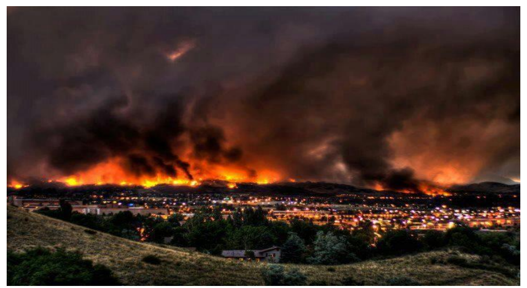
Forest fires, Colorado, USA