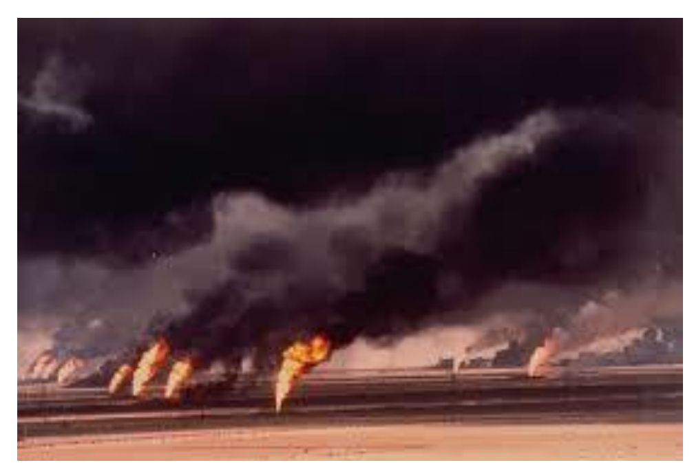
Oil wells burning, Kuwait and the Persian Gulf