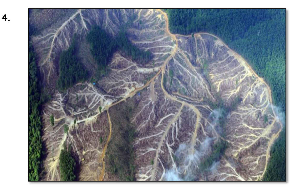
Deforestation in South America