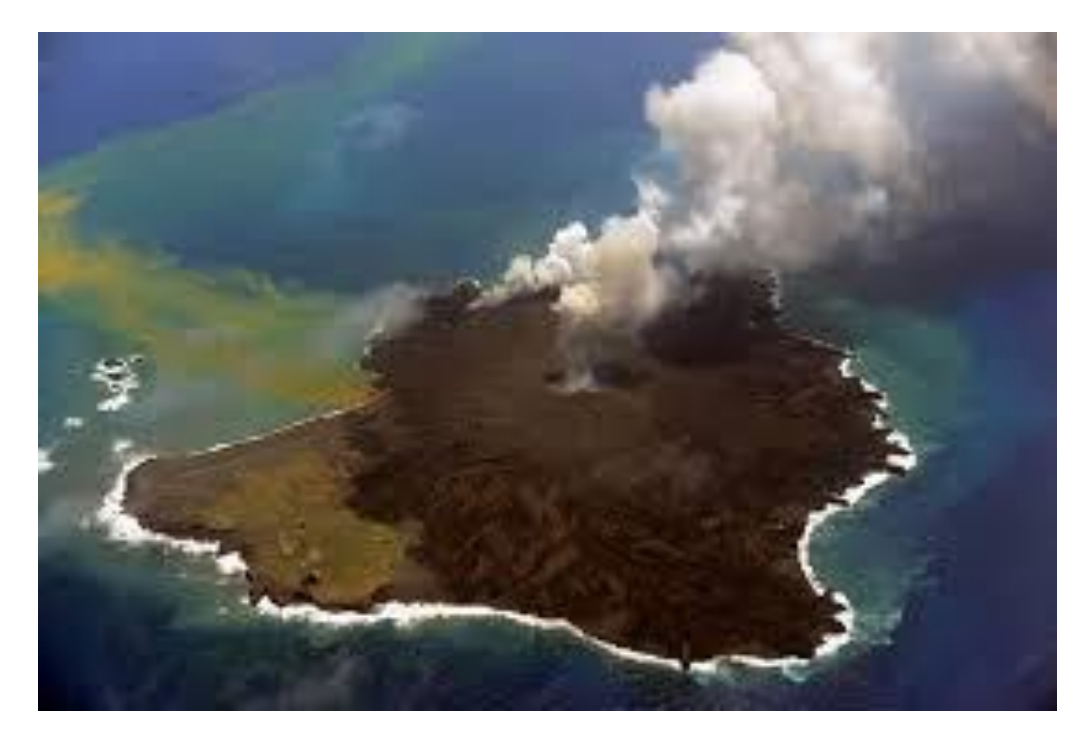
Volcanic eruption on a Pacific island