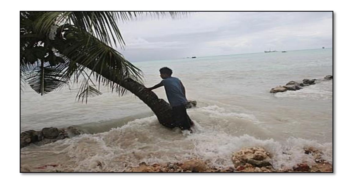
Vanuatu Island, Pacific Ocean