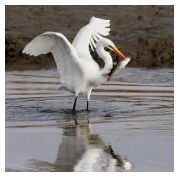
Describe interactions between the hydrosphere and the biosphere for each image.