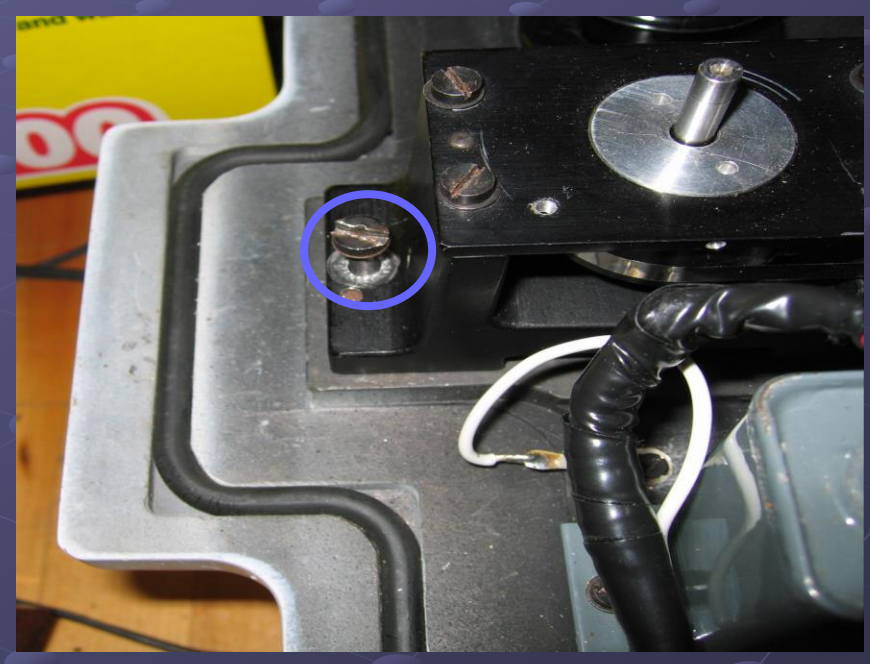
Remove the one set screw at the back of the Wedge

Remove the two set screws on the front of the Wedge