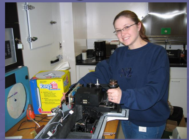
1. Grab the Wedge by the base