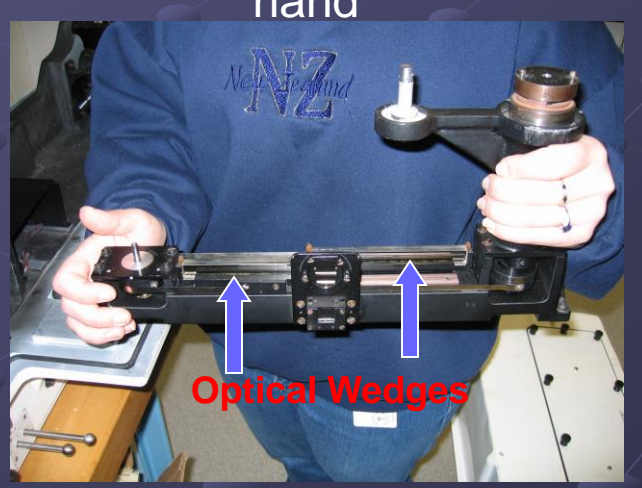
4. Hold the Wedge with both hands taking care not to touch the two optical wedges mounted within