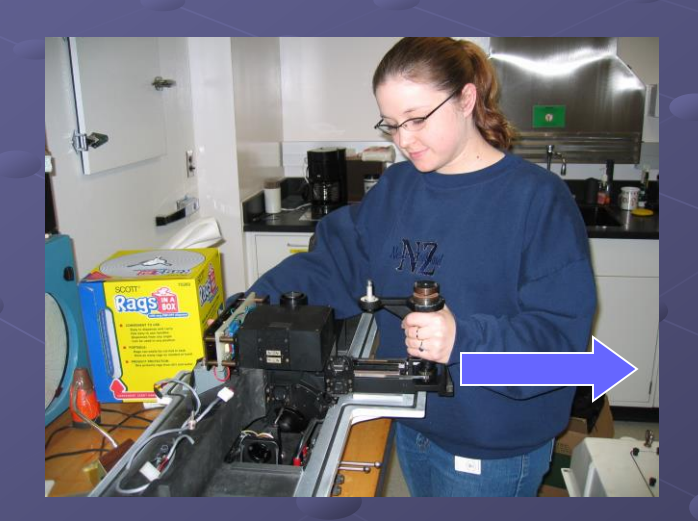
3. Pull the Wedge through the front of the instrument