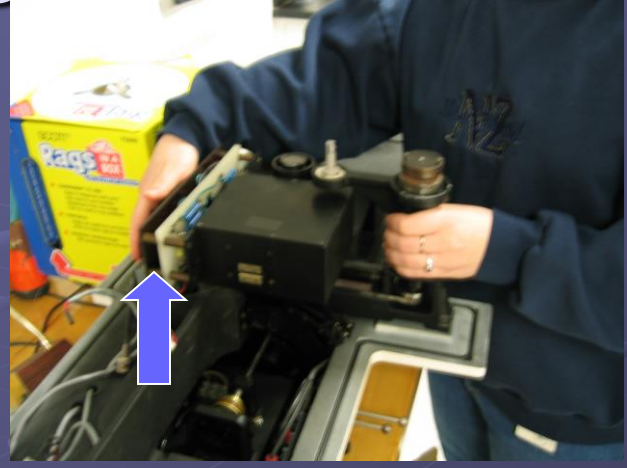
2. Gently lift up the back side of the Wedge with your other hand