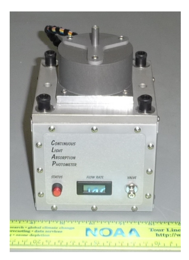
Figure 1. The NOAA/ESRL Continuous Light Absorption Photometer.